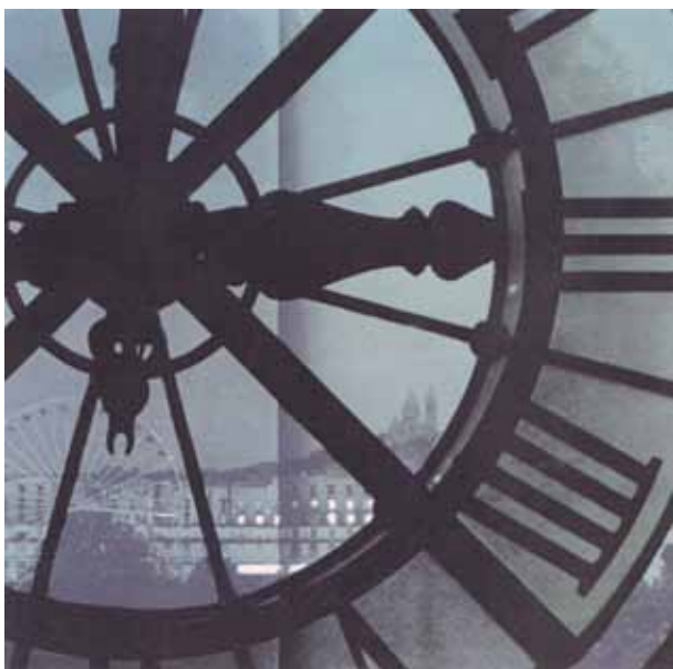
From "The Paris Series"